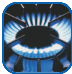
Powerful hob burners