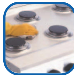
Easy clean fully sealed pressed hob top